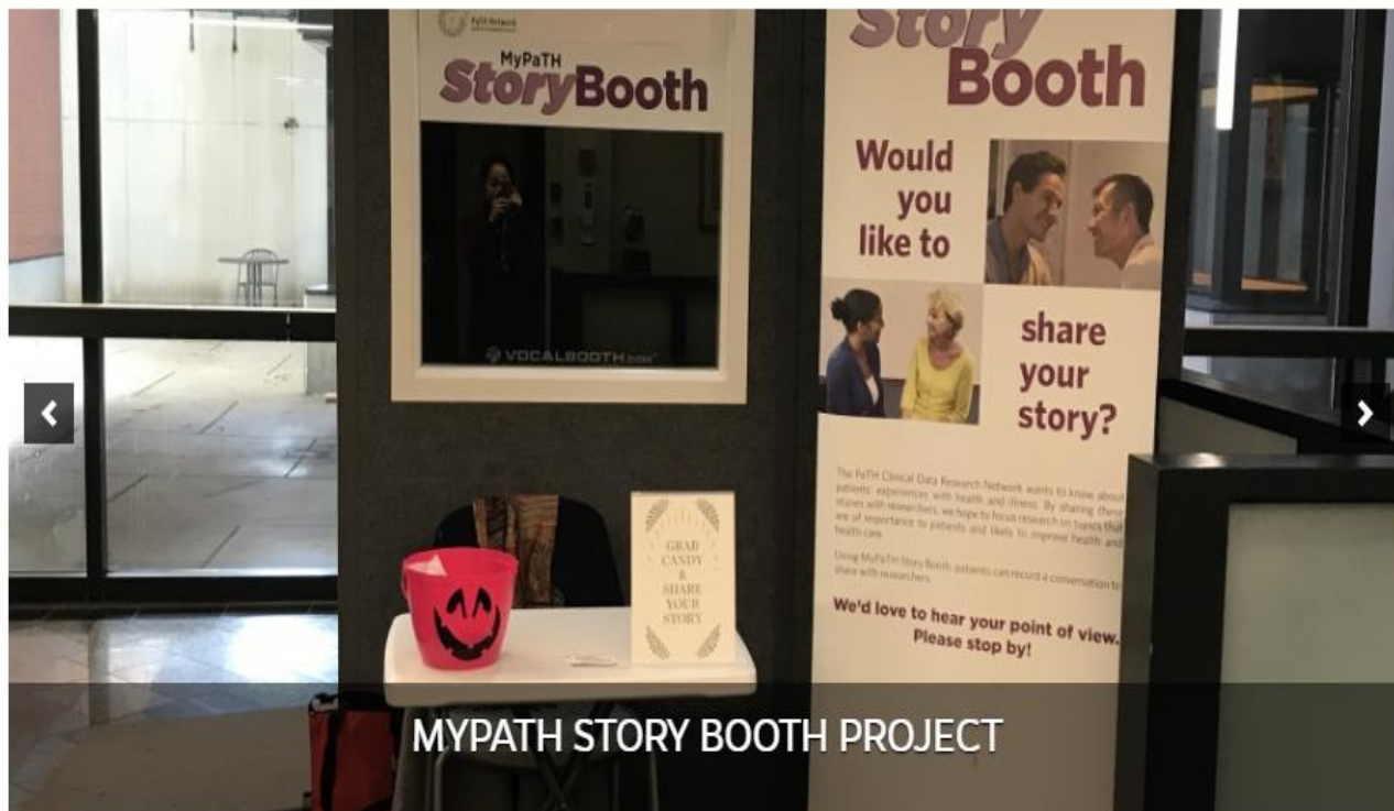
MYPATH STORY BOOTH PROJECT

https://ictr.johnshopkins.edu/study_team/training-education/